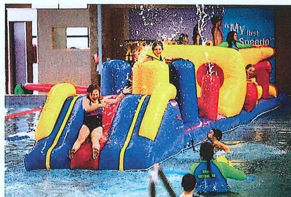
14 School Holidays July 2024