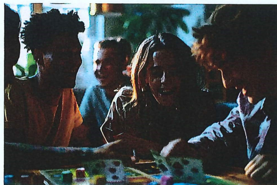
School Holidays July 2024 15

Facebook and Instagram: MitchellYouthServices