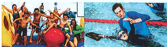
School Holidays July 2024 9